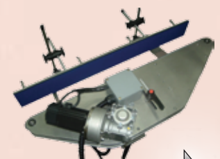
Long belt wrap